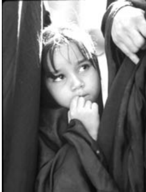
Children as young as four or five years of age have clear concepts of the horrors of war posed by bombs.

Mortality: Estimates of civilian deaths “range from 48,000 to 261,000 for a conventional conflict. If there is civil unrest and nuclear attacks are launched, the range is 375,000 to 3.9 million.” 10 The World Health Organization estimates 100,000 direct and 400,000 indirect casualties and anticipates that “as many as 500,000 people could