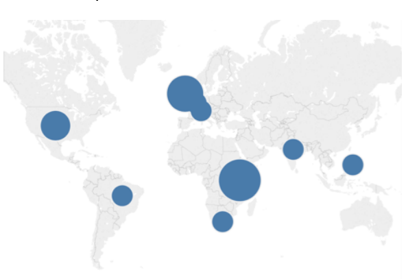
Figure 1 | Location of Survey Respondents

Overall, around one third of survey respondents and interviewees had applied OPERA in their work. It was used to develop indicators and metrics; set program priorities; plan projects; and structure research. It was encouraging to hear the creative array of different topics addressed using OPERA. These included taxation; the right to food; the allocation of resources for disability rights; adequate housing for Indigenous peoples; the rights of internally displace people in transitional justice processes; forced evictions; health financing; and the rights to water and sanitation.